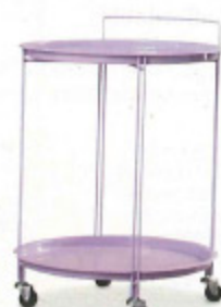
Lavender Metal Serving Cart , $130; allmodern.com