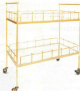
Gold Metal & Glass Serving Cart , $105; houzz.com