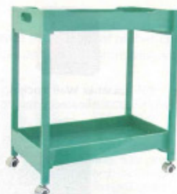
Green Wood Bar Cart , $177; wildorchidquilts.net