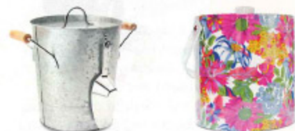
GALVANIZED $26; sugarboandco.com LIBERTY PRINT $88; loveandvictory.com