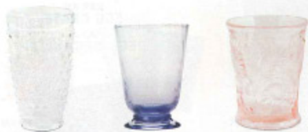
Hobnail Tumbler , $6; pier1.com Arabella Tumbler , $29; juliska.com Thistle Rose , $20; fishseddy.com

There's glassware for red wine and white wine and dark beer and...you get the idea. But a humble tumbler is a versatile vessel for almost anything.