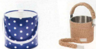
NAVY POLKA DOT $40; mricebucket.com ROPE $98; houzz.com

A compact beverage refrigerator ($1,495; kingsbottle.com) is a convenient way to keep drinks cool, but the simple ice bucket doubles as a cute catchall for nut shells and used cocktail stirrers when it's not iced up.