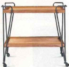
Antiqued Bronze and Veneer Bar Cart , $197; wayfair.com

Open shelving, backed by distressed mirrored glass (prices vary; mirror-tique.com), provides the perfect perch for the tools of the trade, but these wheels, all under $200, will come in handy too.